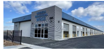
Fig Tree Plaza Chowchilla