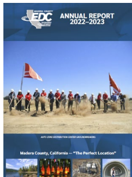
Annual Report 2022-2023

Fresno County SCORE U.S. Small Business Administration, Fresno Office Valley Community SBDC Cen Cal Business Finance Group MCEDC Revolving Loan Program Access Plus Capital