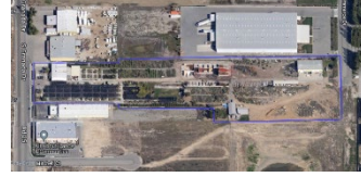
Fig Tree Plaza Chowchilla