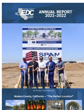
Annual Report 2021-2022