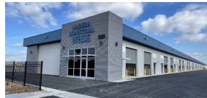
Fig Tree Plaza Chowchilla