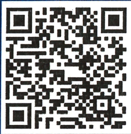
PAC Manual, English