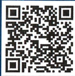
PAC Manual, Spanish