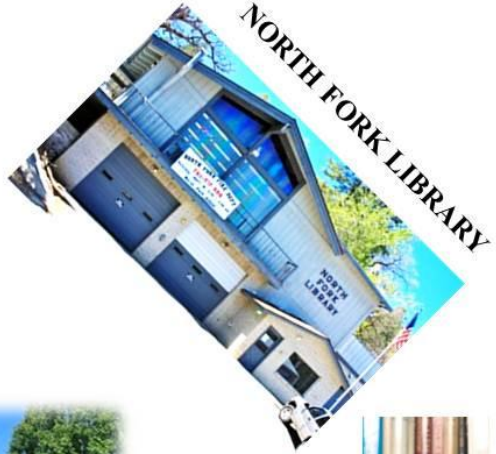
NORTH FORK LIBRARY